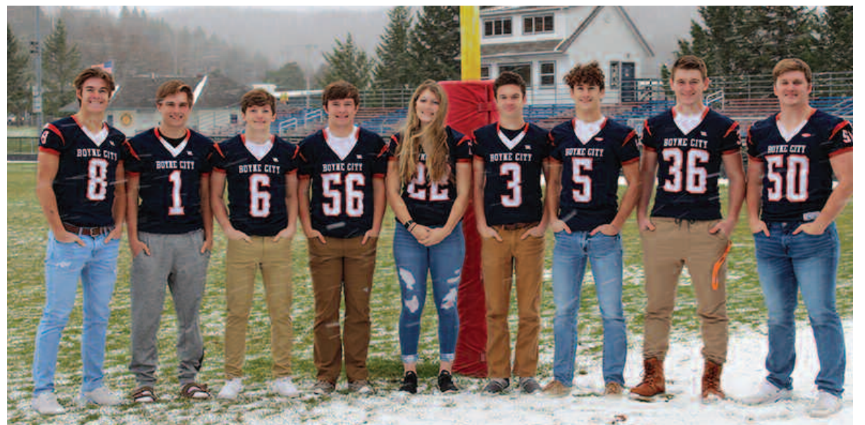
BOYNE CITY 2020 CHARLEVOIX COUNTY NEWS ALL-AREA FOOTBALL SELECTIONS