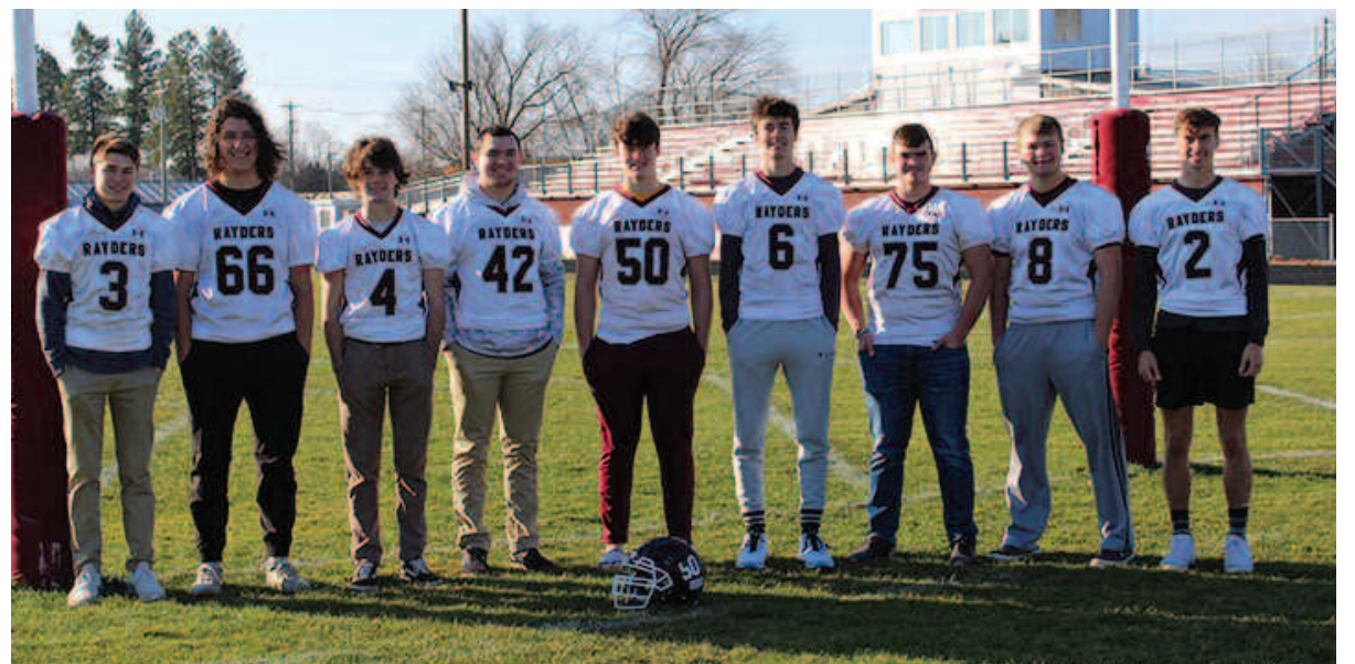
CHARLEVOIX 2020 CHARLEVOIX COUNTY NEWS ALL-AREA FOOTBALL SELECTIONS