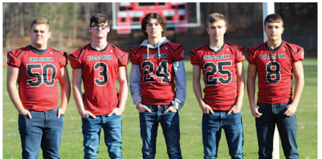
EAST JORDAN 2020 CHARLEVOIX COUNTY NEWS ALL-AREA FOOTBALL SELECTIONS